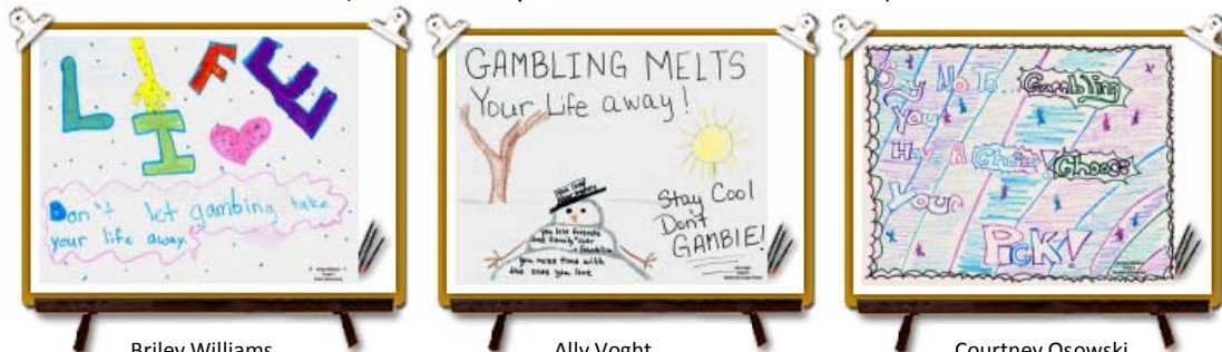
Briley Williams Grade 5 South Elementary

(Artwork samples from the 2009 calendar)